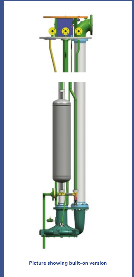
Picture showing built-on version

The system's uncomplicated design ensures ease of operation and maximum reliability. It can be used independently of the tank height, vessels size or the thickness of the cargo.